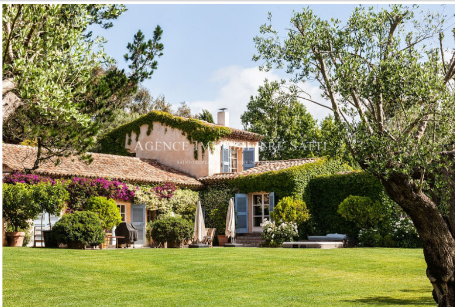
Villa 1941 Gassin

Authentic Provencal farmhouse, located in a closed and secure domain, close to the Golf Club de Gassin. The farmhouse, nestled in a beautiful wooded garden, consists of a large living room, a dining room, a fully equipped open kitchen, 5 bedrooms, two of which have independent outside entrances, four bathrooms, bath/shower and a laundry room. Outside, swimming pool, jacuzzi and several parking spaces.